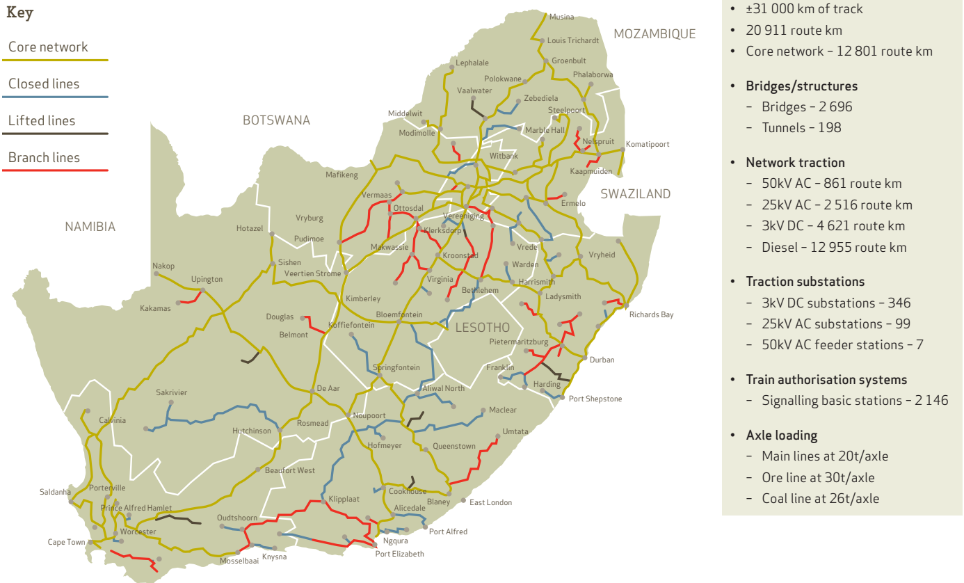
Figure 1: Freight Rail network

Freight Rail has implemented the Corridor Operating Model to respond to the rapidly changing business, market and policy environments, and to drive improved business performance and competitiveness. This model is designed to improve decision-making, responsiveness to customer needs and integrated problem solving. Each corridor is led by a managing executive who is physically located in the heart of the operations. In addition, the closer alignment of Freight Rail corridors with Port Terminals will improve operational interfaces, drive supply chain efficiencies and unlock capacity for growth of volumes on rail.